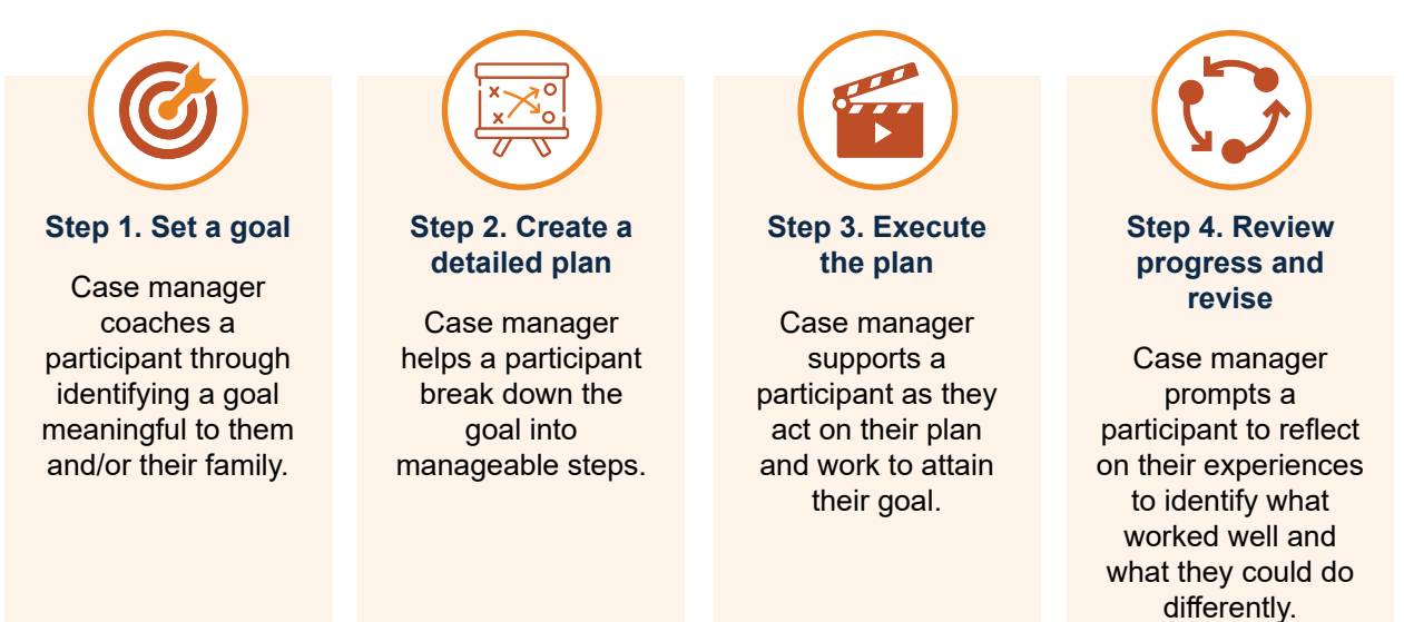
Figure 1. Four steps in goal attainment

<sup>3</sup> Bandura 1990; Bandura 2005; Murray et al. 2015